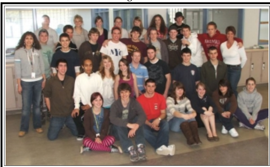
Leadership Class 2008

6:30 p.m. Graduation Ceremony and Walk-Up with Dry Grad Party to follow